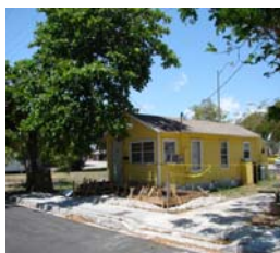
Rebuilding Together Before

Rebuilding Together Miami-Dade Chapter is a 501(c)(3) non-profit foundation that preserves homeownership and revitalizes neighborhoods by providing free of charge rehabilitation services to the elderly, veterans, disabled and low income homeowners. Through the support of corporate sponsors, local businesses and the hands-on work of volunteers, the organization donates approximately $250,000 in market