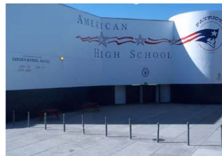
American Senior High School, Miami, FL

On Thursday, February 4, 2010 The Sports Career Expo will be