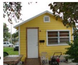
Rebuilding Together After

Join both Habitat and Rebuilding on their mission to better our community. Visit our website for more details.